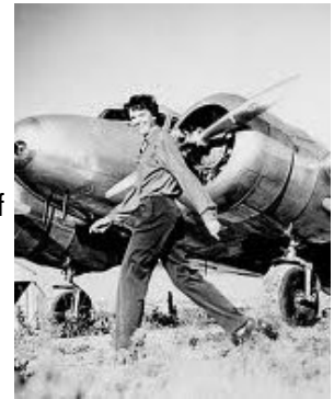
Amelia next to her plane.

We also believe that Amelia Earhart flew off course and ran out of gas then crashed near Marshall Island. After Amelia crashed it is possible that she was able to send radio signals. The Japanese may have found her and took her to Saipan. We even have a U.S. soldier's eyewitness account who was stationed at Saipan at the time say he saw Amelia's plane in a hanger.